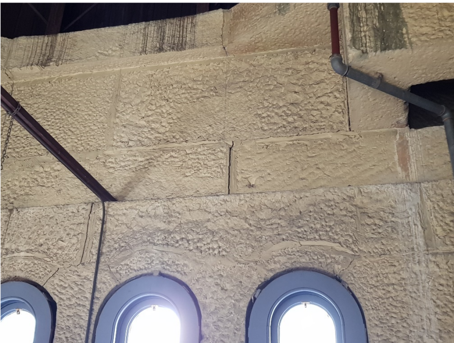
Figure 16: Diagonal Cracking Through Bed Joints Above Windows