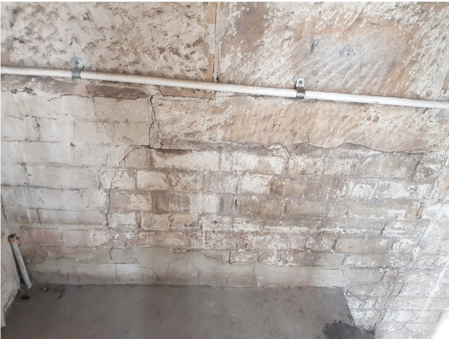
Figure 18: Vertical Cracking at Sandstone Brick Interface