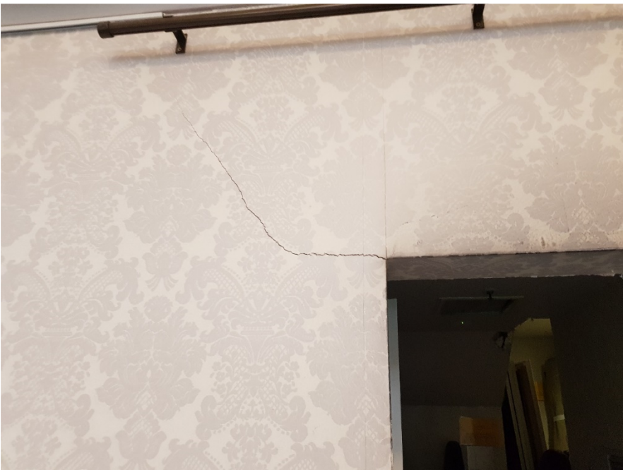
Figure 26: Diagonal Cracking in Tea Room Lintel