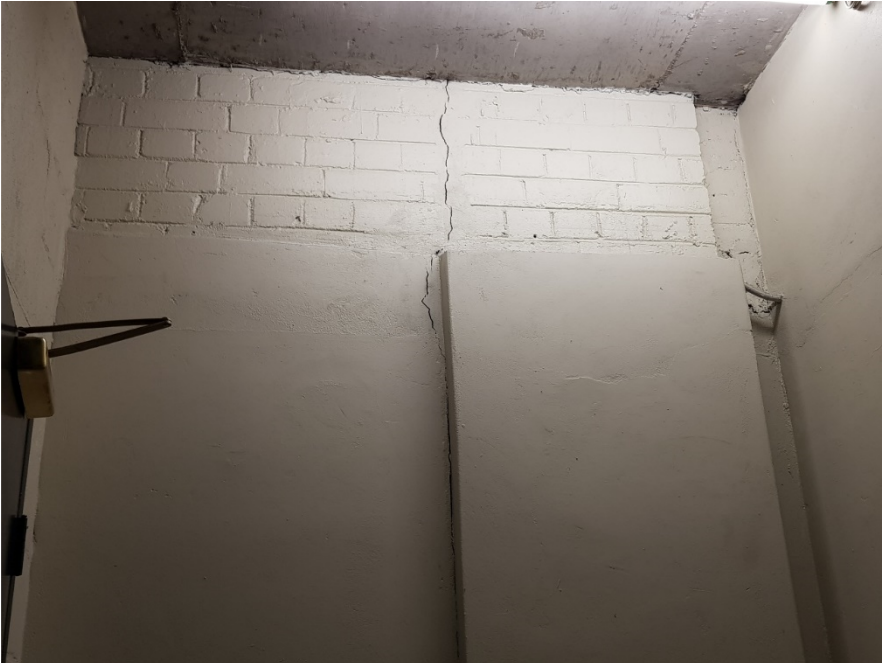
Figure 21: Vertical Cracking in Masonry