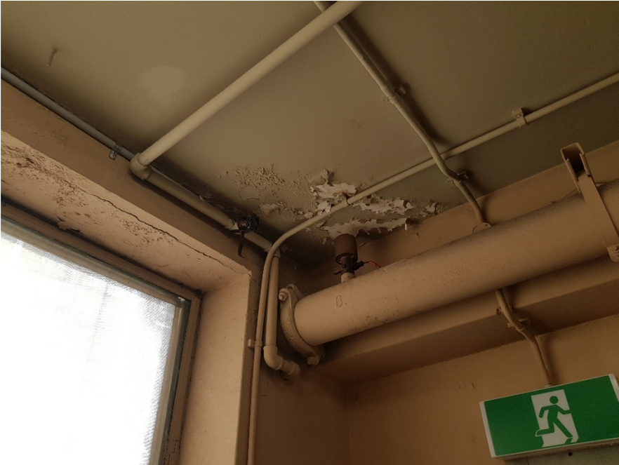
Figure 25: Cracking in Lintel