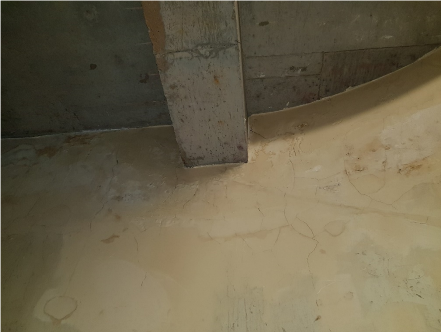
Figure 31: Damp Walls in Fire Escape