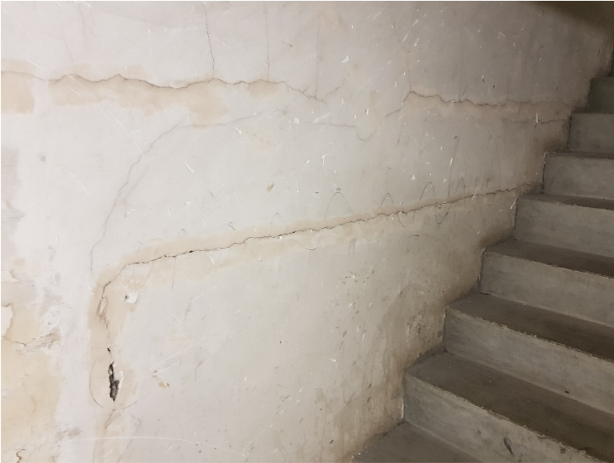
Figure 19: Cracking in Northern Fire Escape Walls