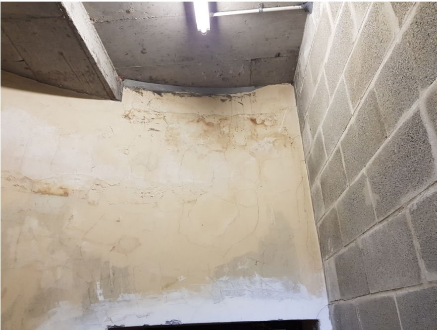
Figure 32: Damp Fire Escape Walls Under North West Flat Roof