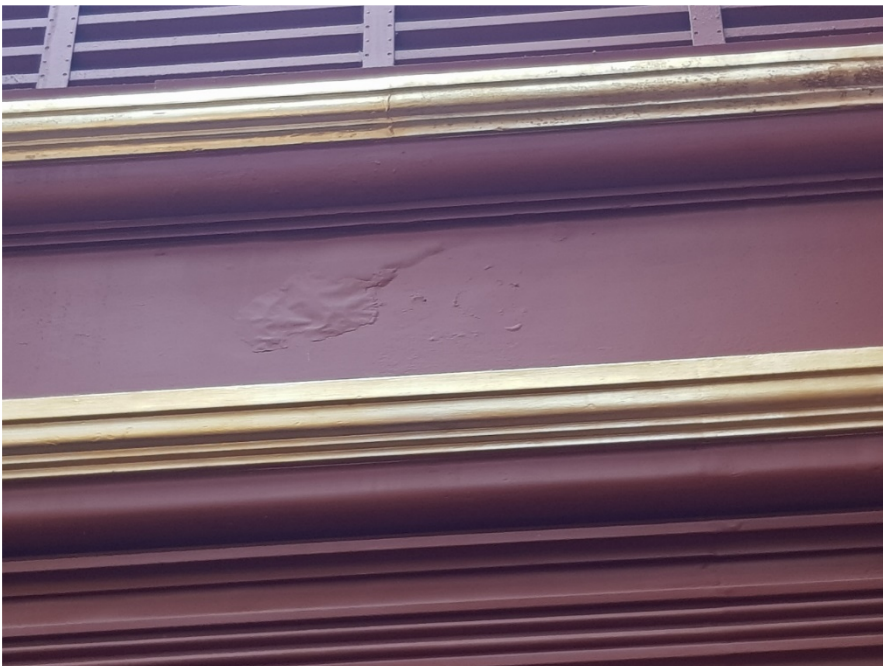
Figure 30: Signs of Water Ingress On Tea Room Entrance Roof