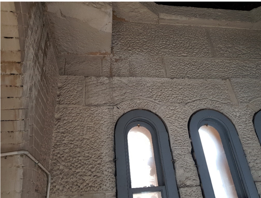
Figure 14: Diagonal Cracking Through Bed Joints Above Windows