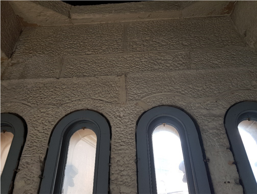
Figure 13: Diagonal Cracking Through Bed Joints Above Windows