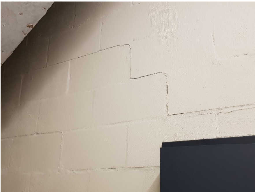
Figure 28: Diagonal Cracking Above Fire Escape Door Opening