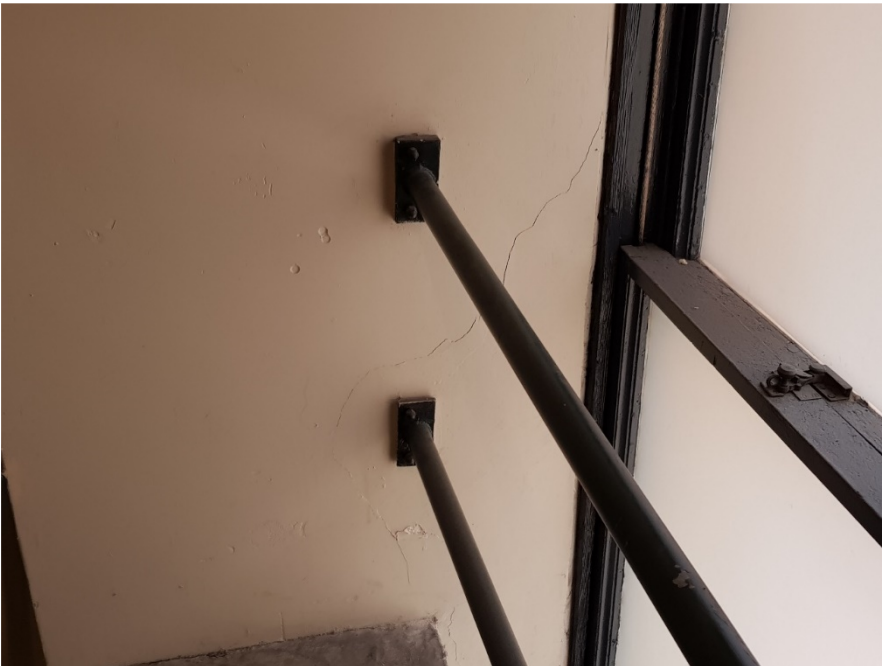
Figure 20: Cracking Around Railing Fixings