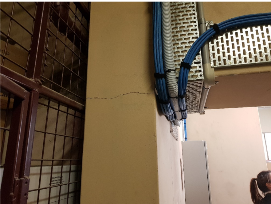
Figure 24: Horizontal Crack in Column