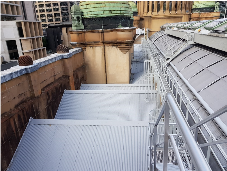
Figure 11: Typical New Access Walkways