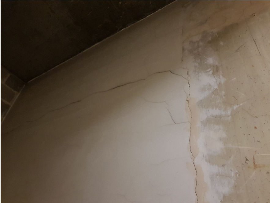
Figure 27: Fire Escape Cracking