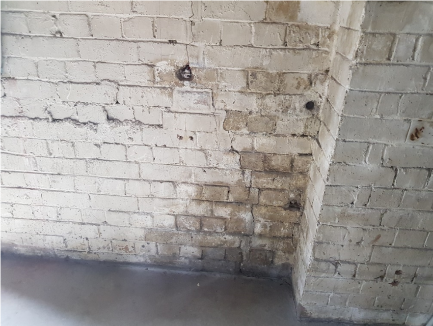
Figure 17: Cracking Around Old Embedded Fixings