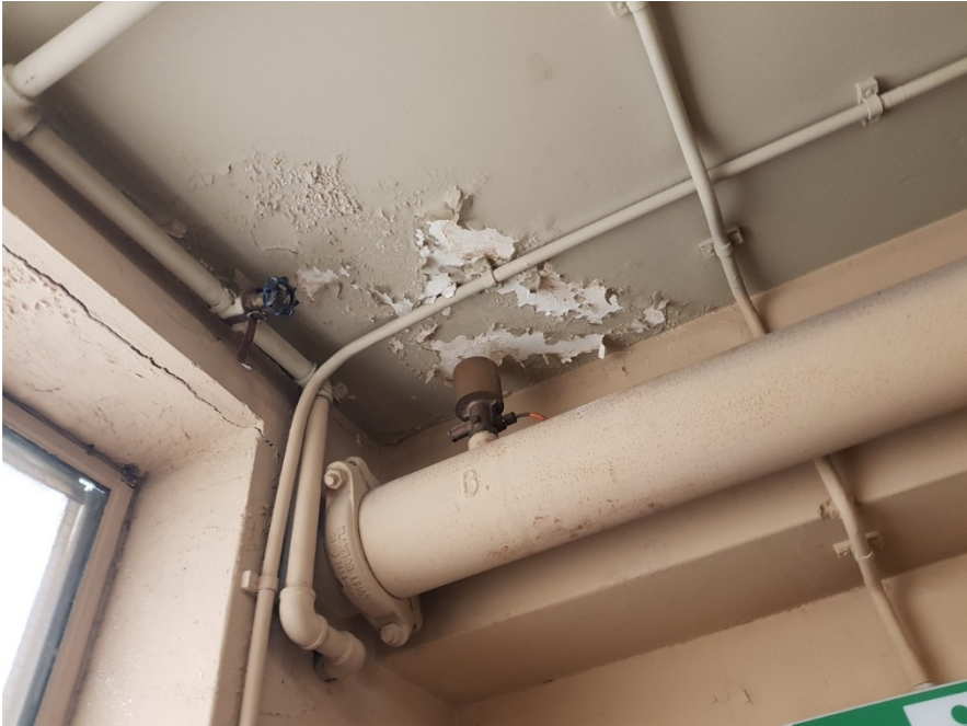
Figure 29: Spalling Concrete