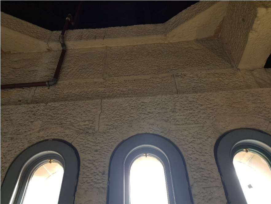
Figure 15: Diagonal Cracking Through Bed Joints Above Windows