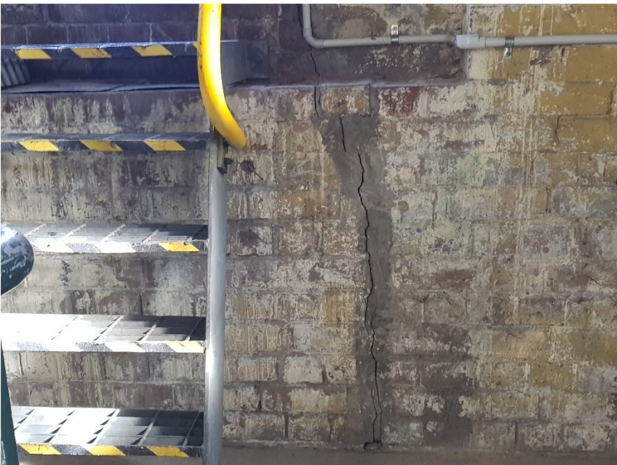
Figure 22: Vertical Cracking in Masonry